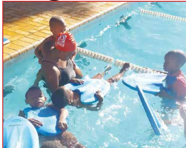
PHOTO: FOUNDATION and intermediate phase learners began their swimming lessons earlier this year. The lessons take place at Penzance Primary School's swimming pools in Umbilo. Photo supplied