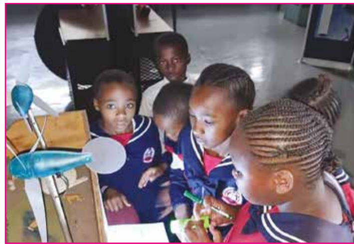
PHOTOS: Grade 6 learners learnt a lot at UKZN's Westville campus during their visit. Photos supplied