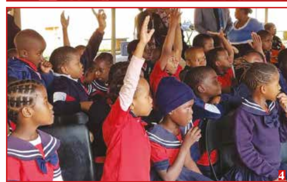
PHOTOS: (1) A firefighter giving fire-safety tips to learners. (2) Transnet official talking to learners. (3&4) Learners raising hands to answer some questions based on what they were taught. Photos supplied