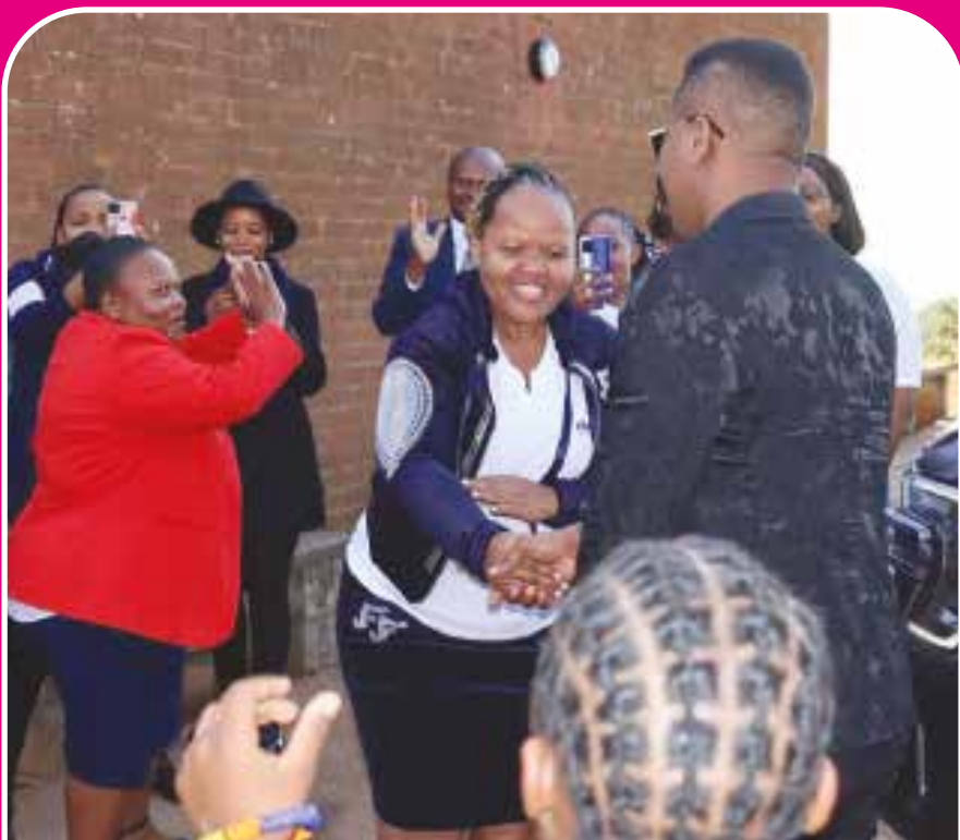
Photo of the term!