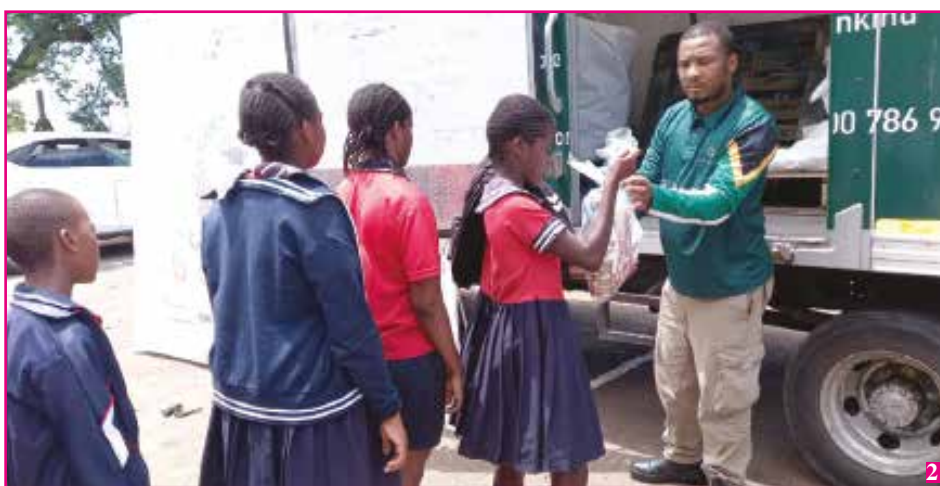
PHOTOS: (1) Recipients of the Gift of the Givers hygiene packs taken with teachers and agents from the foundation. (2) They were taken receiving hygiene packs from a Gift of the Givers agent.