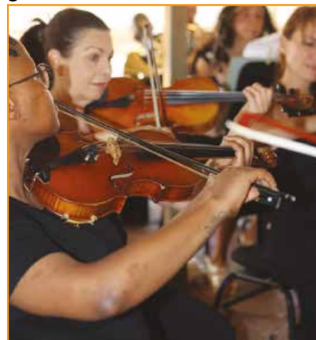
PHOTOS: Learners had a blast watching the KZN Philharmonic Orchestra's performance.